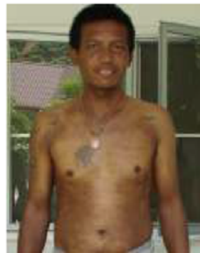
Before MRET consumption on 28 Aug.2004