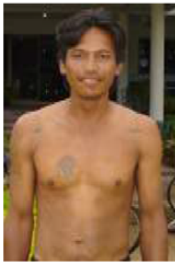
After MRET consumption on 9th July, 2004